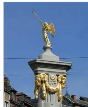
Angel Fountain - Namur ING Sponsorship