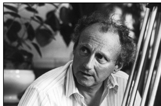
Cinematek - Delvaux Collection Triodos Bank Sponsorship